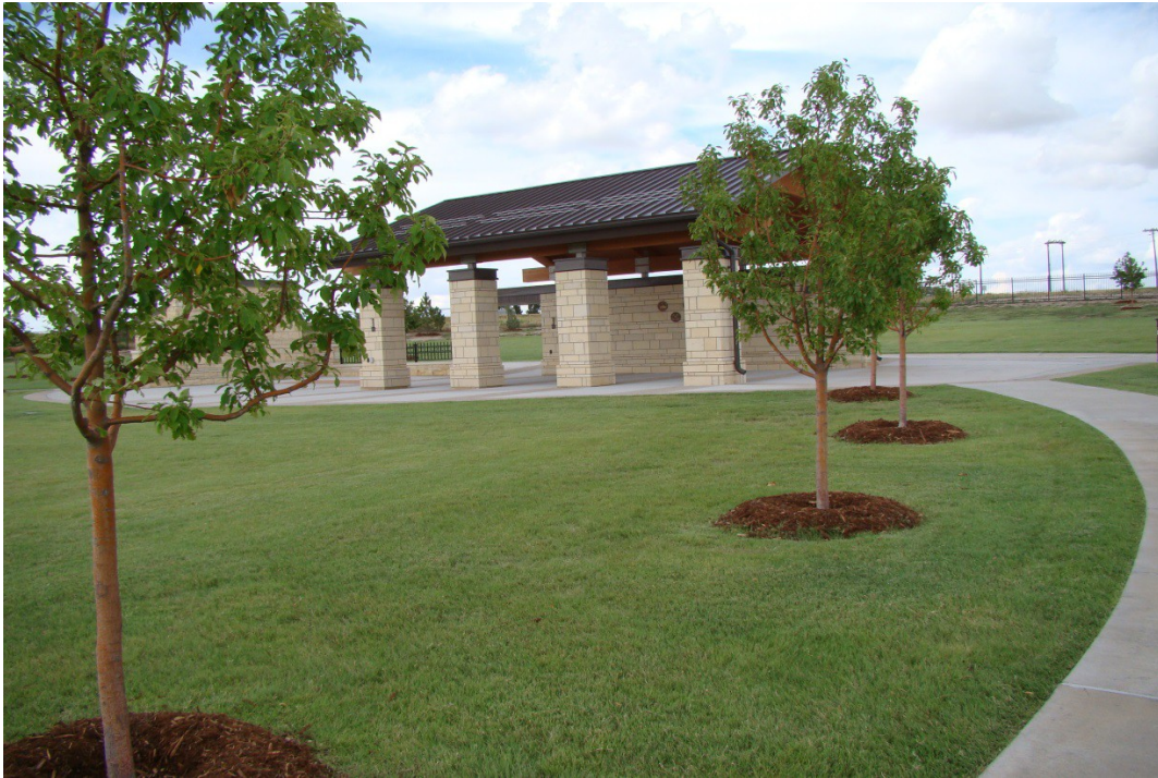
The committal shelter, outfitted with seating and a sound system during ceremonies, provides a solemn beautiful setting in the warm months.